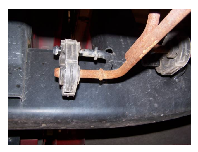
Page 7 of 15 Rev 2.doc , 7-25-