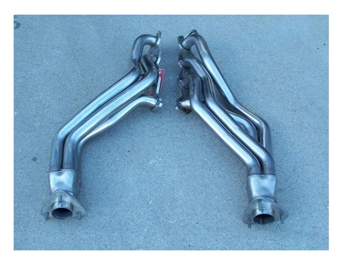
4WD Dodge Hemi 1500 Headers