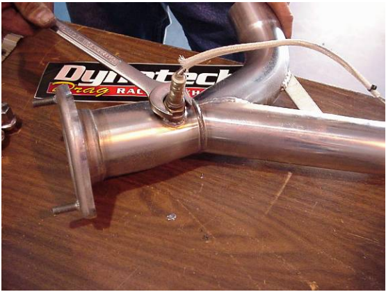
(The above pictures are for reference only and may not reflect the actual part)