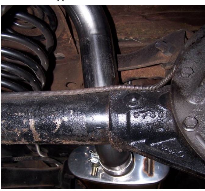
Page 11 of 14