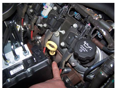
Page 4 of 12