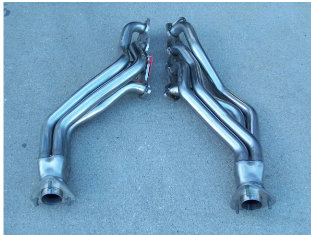
4WD Dodge Hemi 1500 Headers