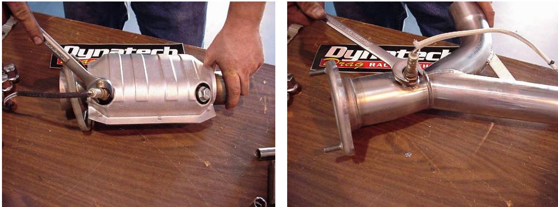
(The above pictures are for reference only and may not reflect the actual part)